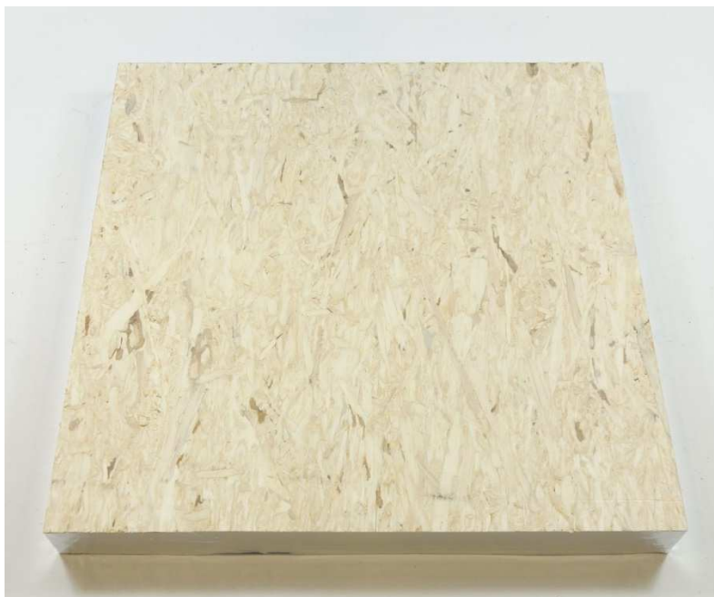
A002: LignumStrand treated

Remark: The test result referred to the submitted test sample exclusively. The validity of the report is three years at most and will end immediately at any alternation of material composition or in manufacturing process. Publishing in parts requires authorisation.